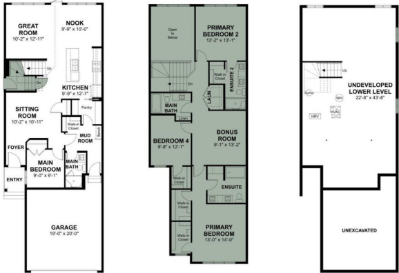
The Artemis | 2,270 Sq. Ft.

DATA IS DEEMED RELIABLE BUT IS NOT GUARANTEED ACCURATE BY THE REALTORS® ASSOCIATION OF EDMONTON. COPYRIGHT 2025 BY THE REALTORS® ASSOCIATION OF EDMONTON. ALL RIGHTS RESERVED.Trademarks are owned or controlled by the Canadian Real Estate Association (CREA) and identify real estate professionals who are members of CREA (REALTOR®, REALTORS®) and/or the quality of services they provide (MLS®, Multiple Listing Service®) Listing information last updated on August 20th, 2025 at 5:32am MDT